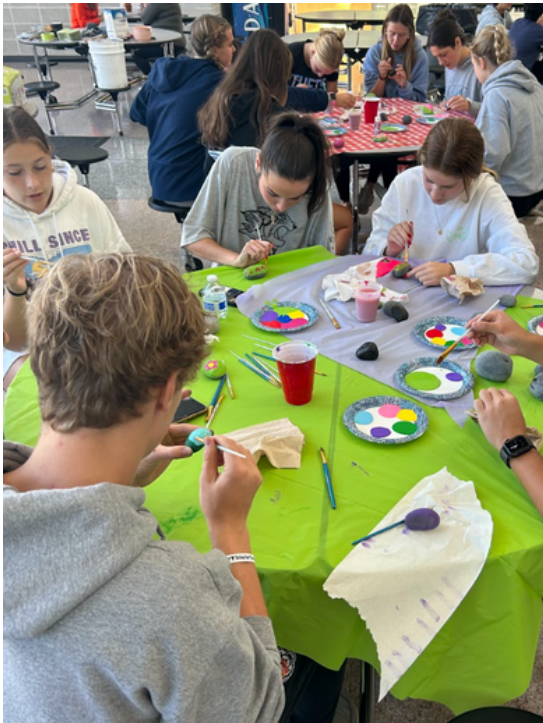
Students painting kindness rocks

In addition to the mural, there are three mosaic butterflies featured on each side of the painting. Butterflies were one of Nia's favorite creatures and they are also symbols of loved ones passed on. Butterflies are pictured throughout the garden from the mosaic, additional painted butterflies on the wall to butterfly stickers placed on the student center windows.