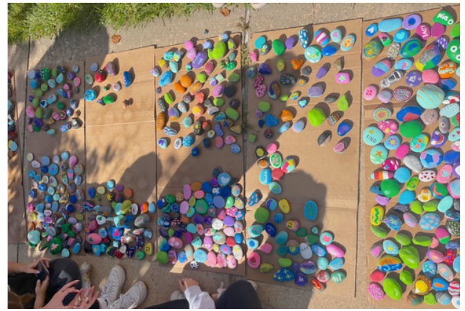
Kindness rocks that have been painted