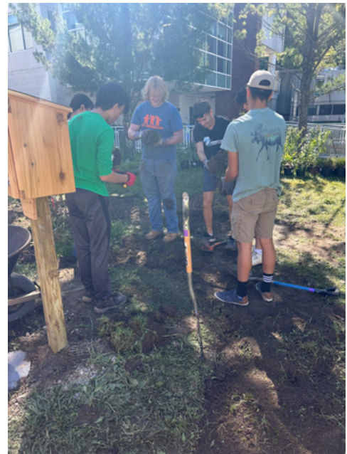
Picture of students helping plant flowers in the garden

The garden will be officially unveiled on Thursday, however students and staff hope it will be used and maintained for years to come.